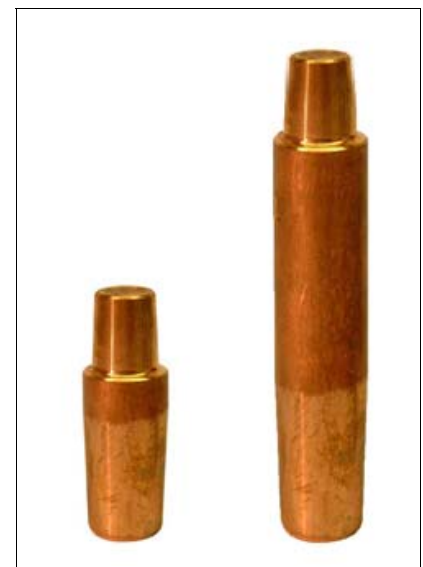
BS807 taper into welder ISO 1:10 taper for cap. Blind cooling hole